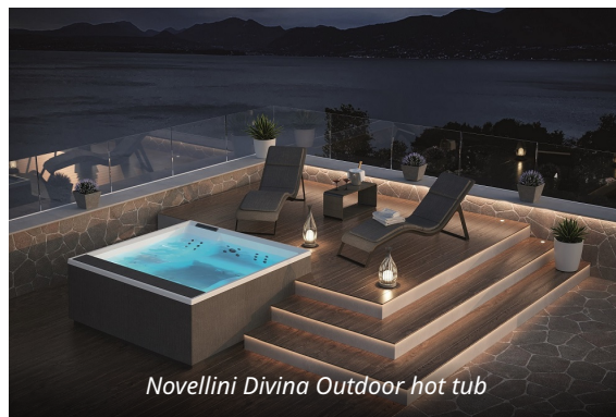
Novellini Divina Outdoor hot tub