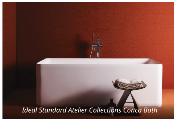
Ideal Standard Atelier Collections Conca Bath

Designing bathroom spaces for the hospitality sector requires a fine balance of function with aesthetics. Products should look and feel luxurious without feeling complicated to use.