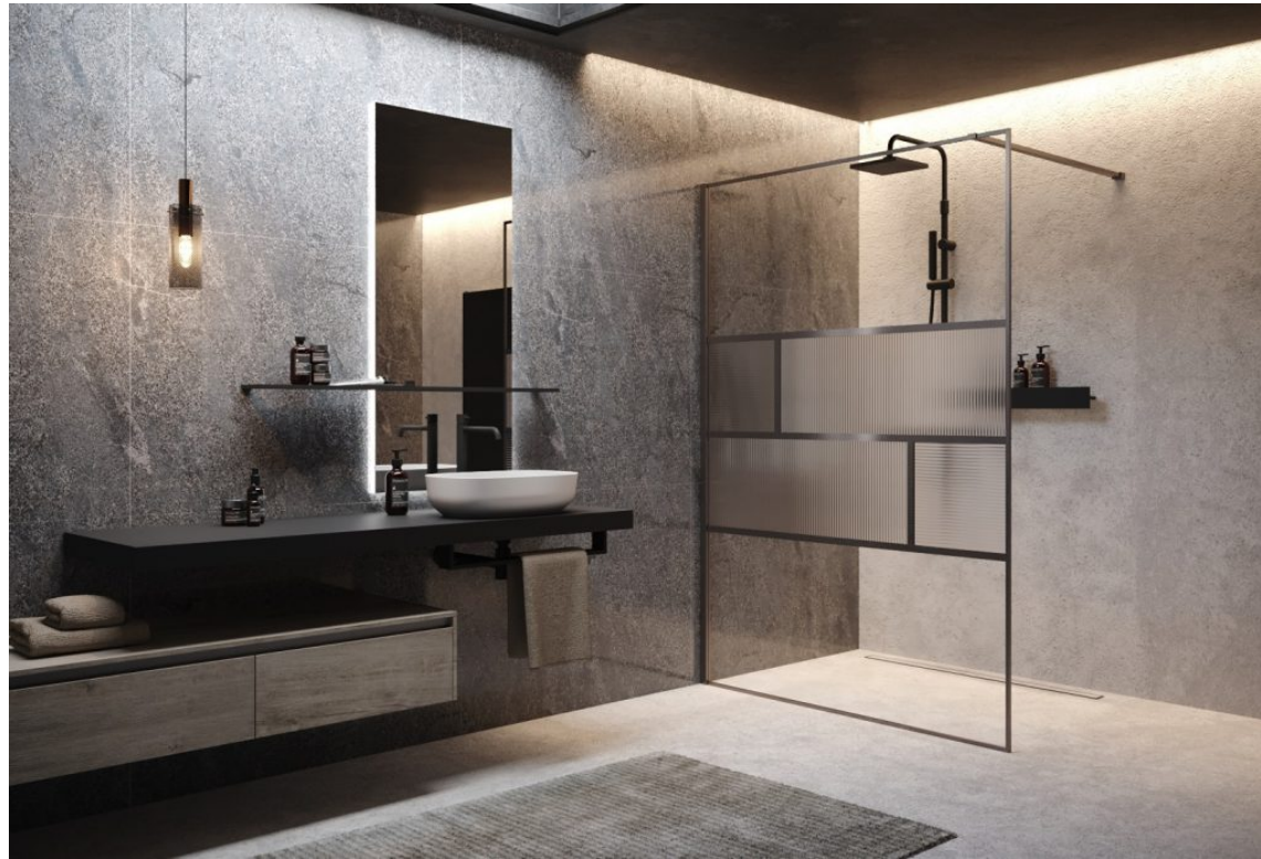
Novellini slate effect shower tray

The hospitality sector is looking for minimalist, contemporary and low-maintenance bathroom designs. Wetrooms are favoured for their sleek design and accessibility, and for enclosures, Novellini notes that its low-profile, slate-effect shower trays are in high demand.