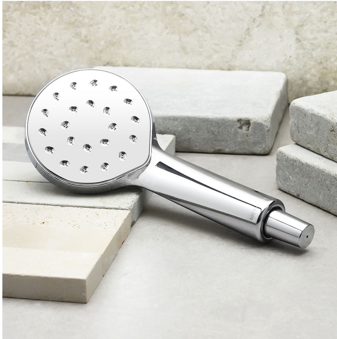
Methven Kiri shower handset

Water efficiency underpins everything in bathroom design, and this is especially important for the hospitality sector – not just to bring peace of mind to customers, but to be as cost-effective as possible.